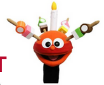
Chris the Christingle